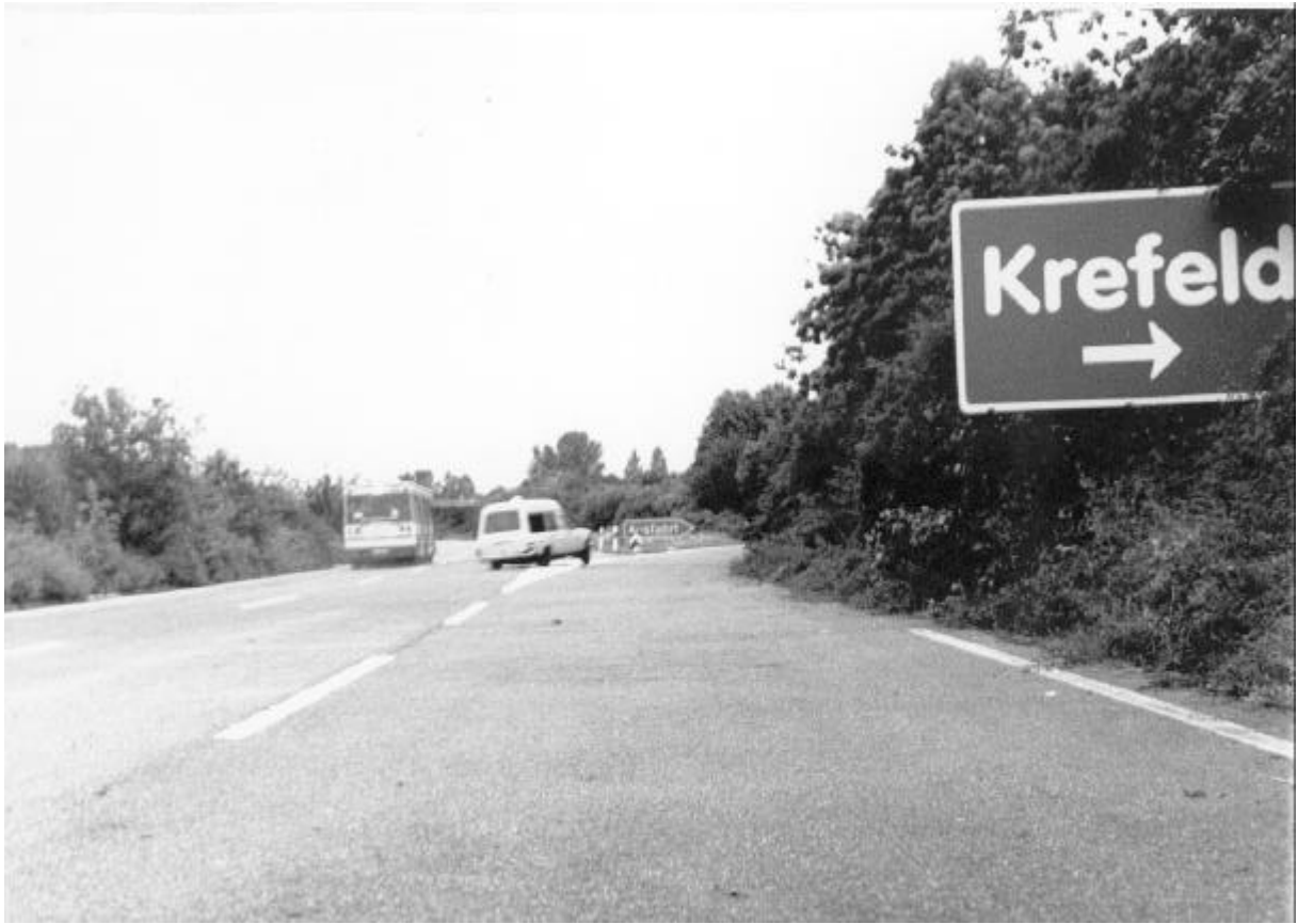
Opening sequence: the band Beam Me Up, Scotty!, returning in their blues mobile from the live gig in Berlin, 1992.