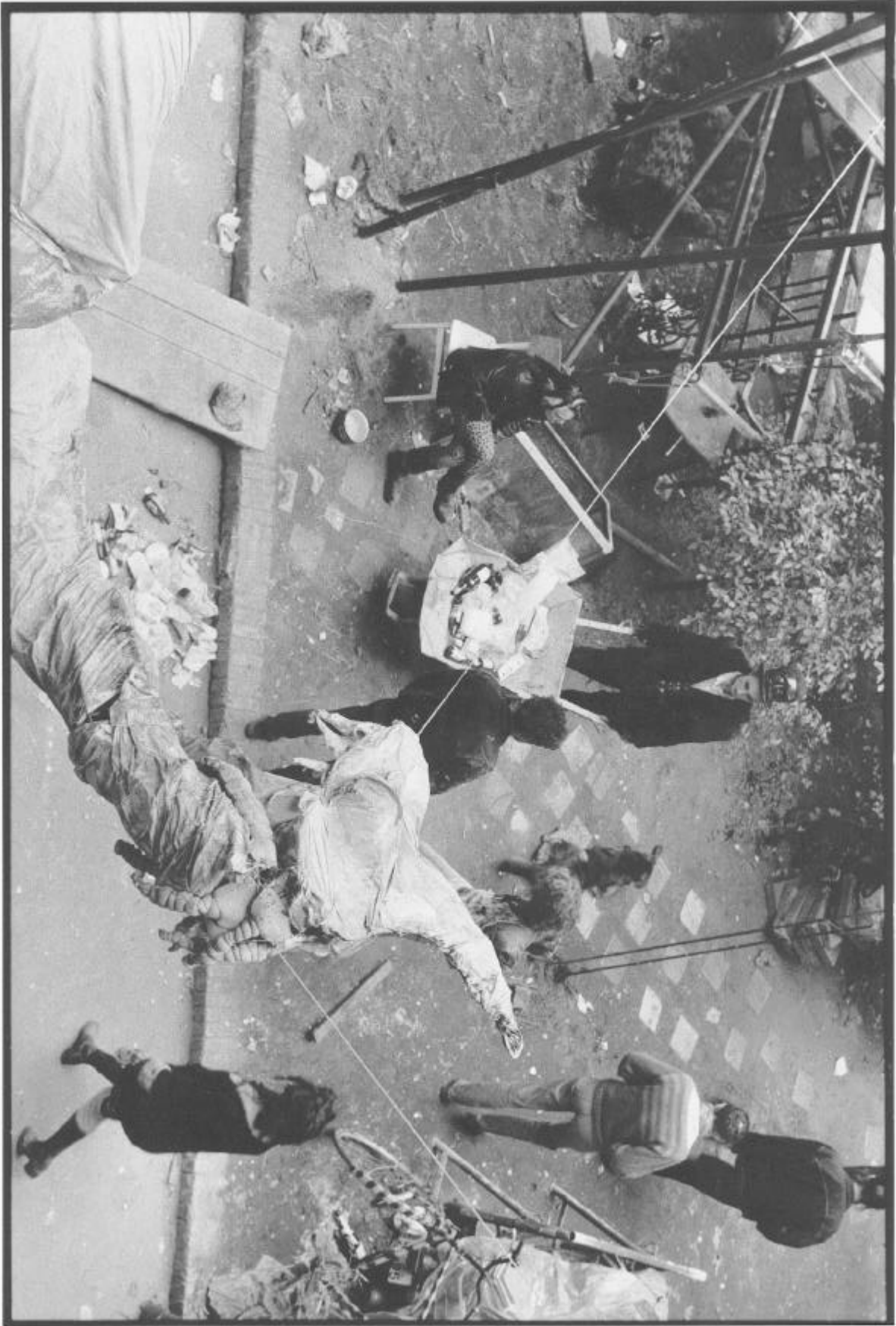
Preparing the gig - Live Concert Berlin -Germany 1992